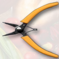
4 1/2" Mini Pliers, SS