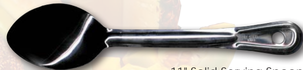
11" Solid Serving Spoon