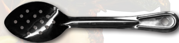
11" Perforated Serving Spoon