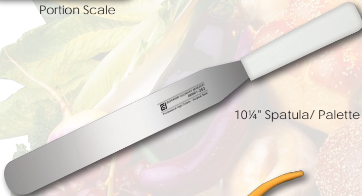
10 1/4" Spatula/ Palette Knife