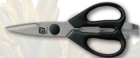
Take-A-Part Kitchen Shear