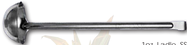
1oz. Ladle, SS