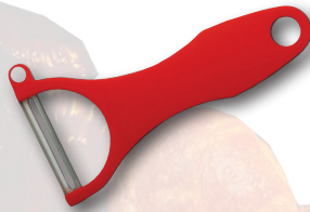
"Y"/Wishbone Style Peeler