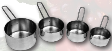
4 Piece Measuring Cup Set