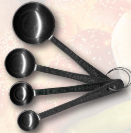
4 Piece Measuring Spoons