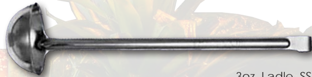
3oz. Ladle, SS