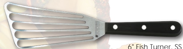
6" Fish Turner, SS