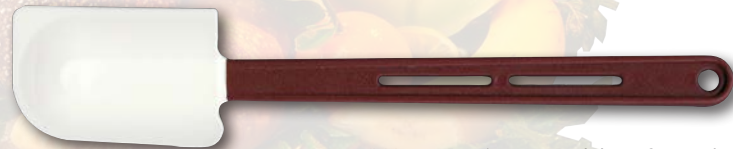
14" Heat Resistant Rubber Spatula