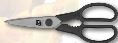
8" Take-A-Part Kitchen Shear