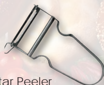
"Y" Star Peeler