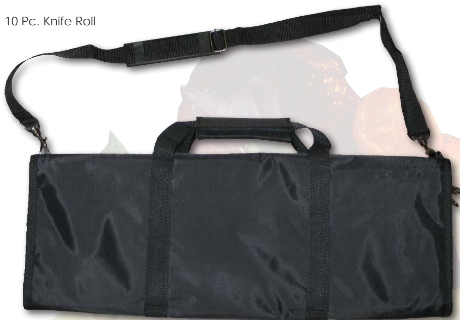
10 Pc. Knife Roll