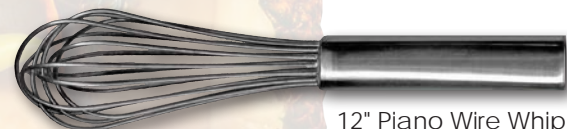
12" Piano Wire Whip