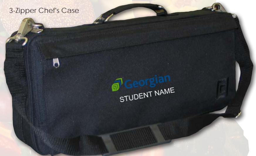
3-Zipper Chef's Case