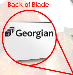
Back of Blade