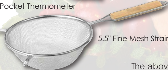
5.5" Fine Mesh Strainer