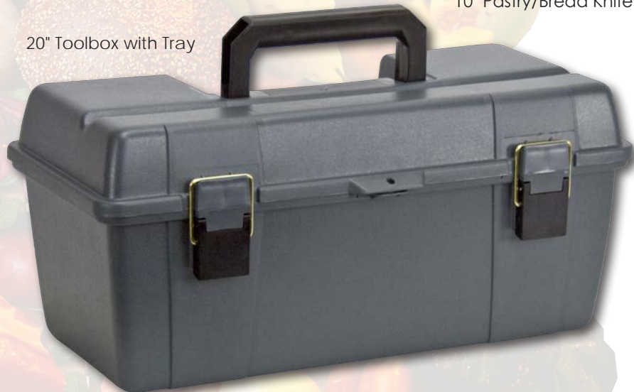
20" Toolbox with Tray