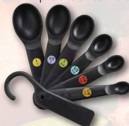
6 Piece Measuring Spoon Set