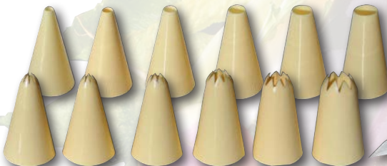
6 Piece Hole & Star Piping Tubes Set