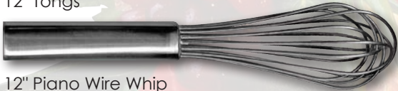
12" Piano Wire Whip