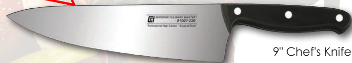
9" Chef's Knife